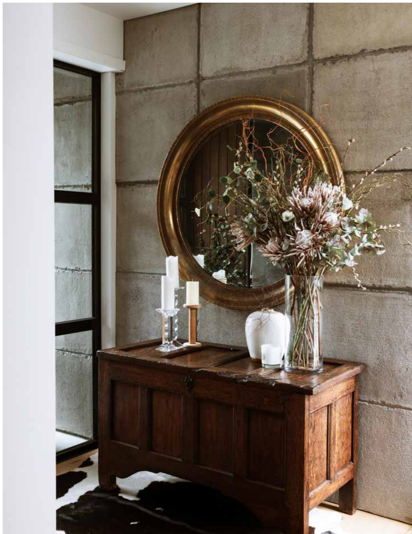
MADE BY HAND Large concrete blocks feature throughout the house and look particularly striking in the main entrance with the antique storage box, which was bought 30 years ago. "Howard made one block each day, then we rusticated them to get them a little rougher to suit our style," says Gaelene. TV ROOM (opposite) This cosy area off the main family room was built with the grandchildren in mind, but it has become a space the couple also enjoy using in the evenings to unwind.

jumping around living in different rental properties, and then a tiny little space. It was hard at times, especially when we were looking after grandkids in a small space. But we all got to love it. Our kids always say, 'Home is where Mum and Dad are?'