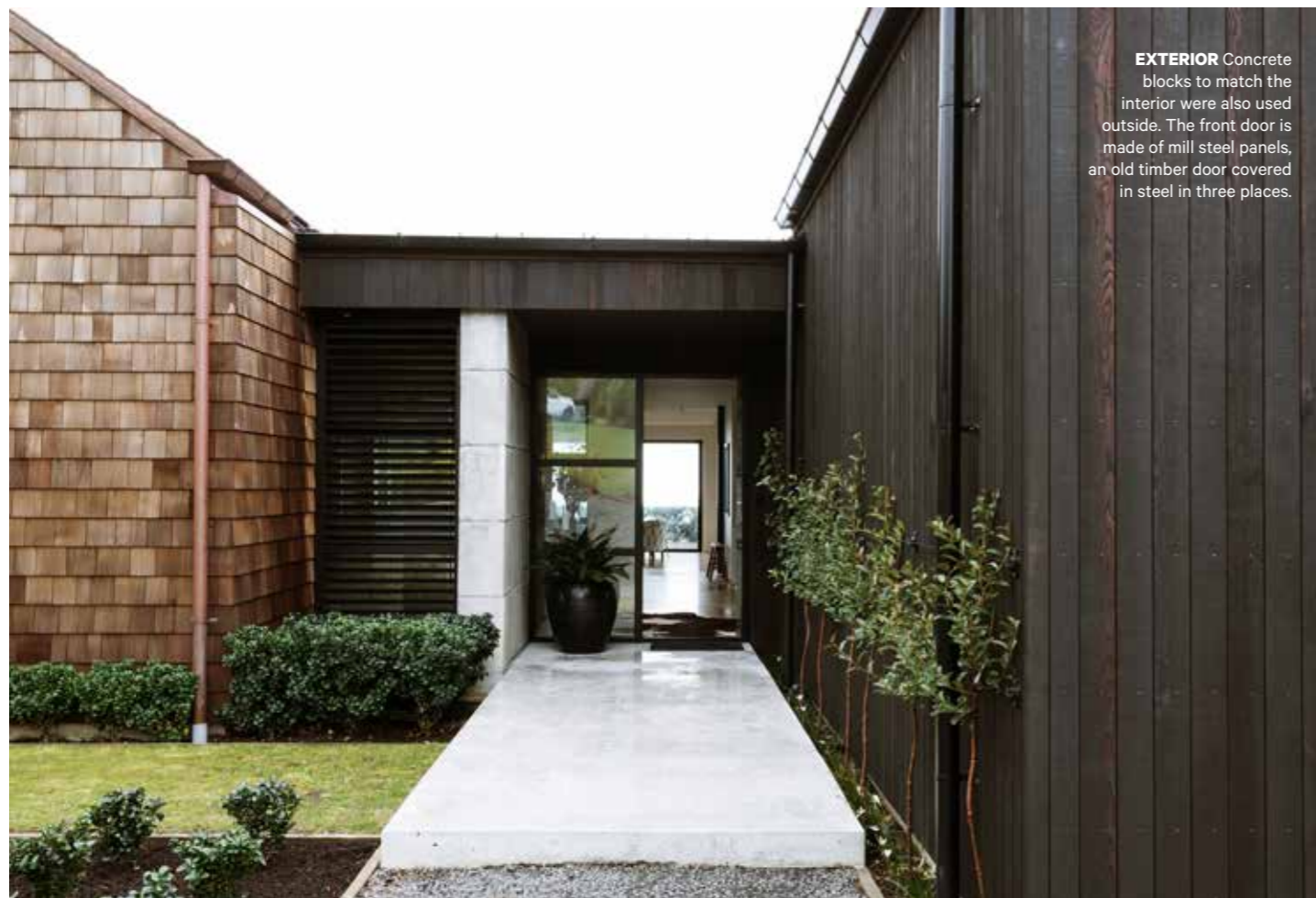
EXTERIOR Concrete blocks to match the interior were also used outside. The front door is made of mill steel panels, an old timber door covered in steel in three places.