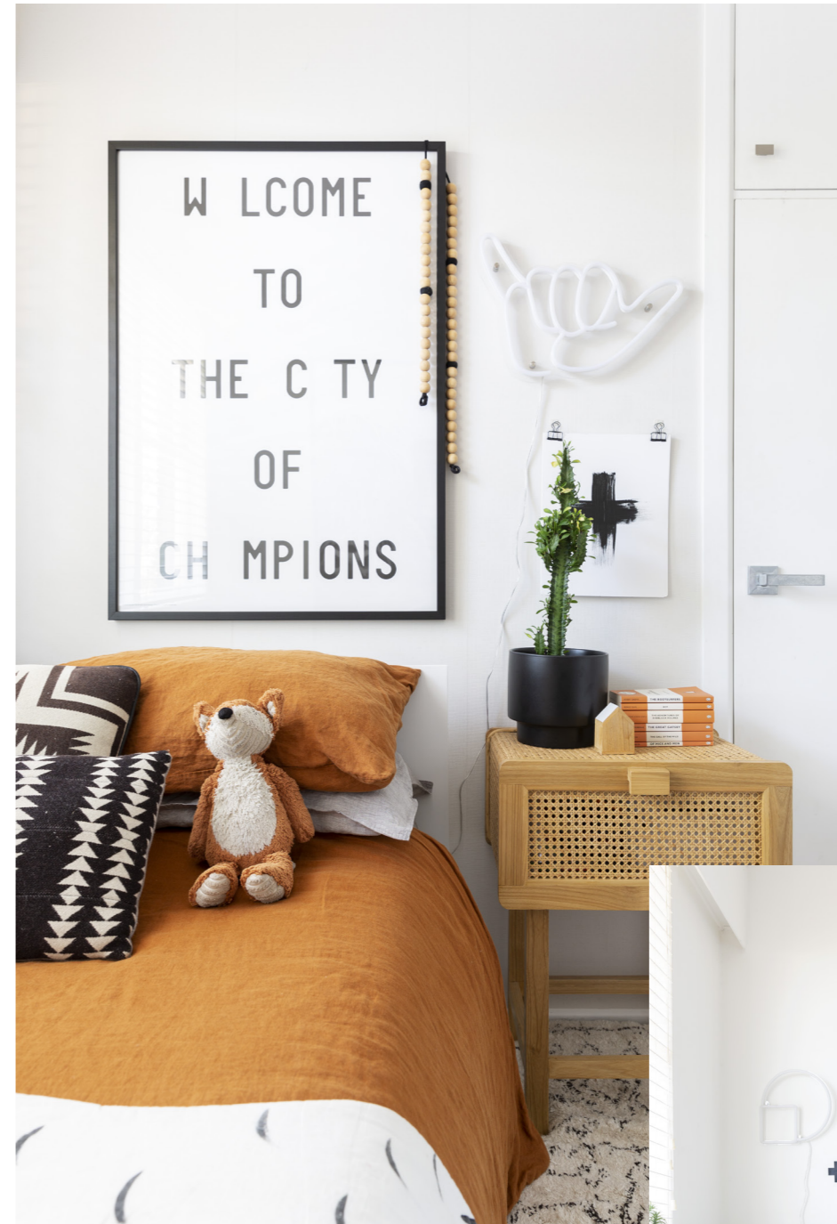
LEFT The colour palette in Cruz's room is enlivened by Tobacco bedding from Foxtrot Home and patterned cushions from Etsy. The artwork is from The Poster Club and below the wall-hung light from Radikal Neon is a bedside table from Bohème Home. BELOW Pieces from Radikal Neon, The Poster Club and Foxtrot Home also feature in Isaac's bedroom.