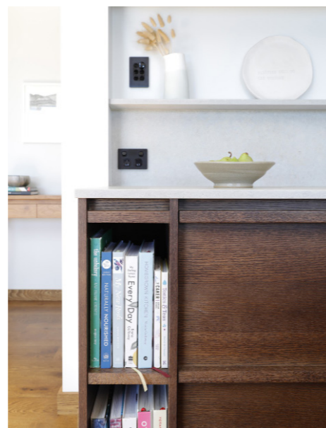
ABOVE Details not in the story about the kitchen please, including the style name and maker of the bar stools, style name and maker/brand of the tapware from Plumline, appliances, info on the design purpose of the shelving and ledge detail, and some of the key objects we can see on them from left to right. RIGHT Where in the house is this? Style name and maker details of the items here left to right and perhaps something about who crafted the cabinetry and what timber was used here? OPPOSITE Info about this nook (or does Siobhan call it a concealed pantry?), including how it works for Siobhan (there must be a story here about this epic organisational system and Siobhan’s need for order. Who set this up for her?), and the style name and maker info of the tiles from Tile Space. Also, who crafted the kitchen?

In natural materials and neutral colours, the resulting team effort exudes a sense of sophisticated calm. The home’s generous, light-filled layout provides ample areas for the family to enjoy – the favourite spot being the outdoor living space. >