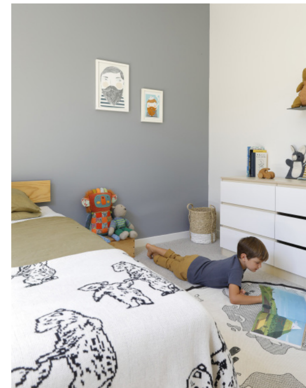
ABOVE Style and brand name of the carpet, style name of cabinet from Inkah, style name and maker of cot, blanket and wagon. Paint brand/colour and style name and retailer of curtain fabric. Plus anything else that would be interesting about the girls' room. TOP RIGHT What room is this? Style name and maker of the mirror, style name of the basin from Raw Concrete Design, style name and brand of the tapware from Plumline (and is it brass, or aged brass?), plus the paint brand/colour and who made the vanity from what type of timber? RIGHT Paint brand/colours x 2, and are those drawings on the wall by Felix? RIGHT Paint brand/colours x 2, and are those drawings on the wall by Felix? Style name and maker of his sheets, duvet, rug and dresser. OPPOSITE Is this the playroom? Style name and maker details for the shelving, animals busts x 2, rug/playmat and storage baskets on the shelves and on the floor beside them. What does Siobhan find so great about having a dedicated playroom?