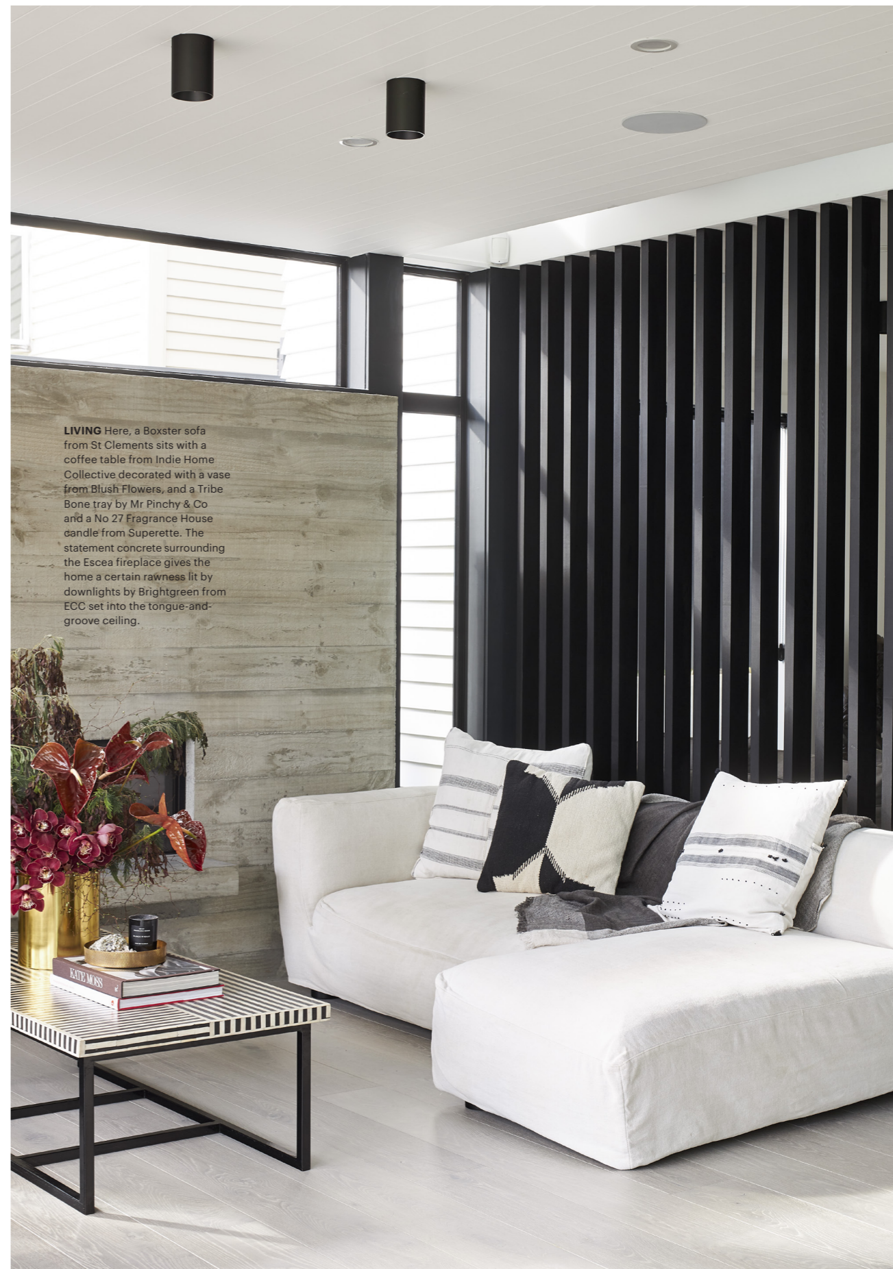
LIVING Here, a Boxster sofa from St Clements sits with a coffee table from Indie Home Collective decorated with a vase from Blush Flowers, and a Tribe Bone tray by Mr Pinchy & Co and a No 27 Fragrance House candle from Superette. The statement concrete surrounding the Escea fireplace gives the home a certain rawness lit by downlights by Brightgreen from ECC set into the tongue-and-groove ceiling.

It's a dilemma many of us face at some point. As our family grows bigger along with our weekly grocery bills, do we renovate our existing abode or sell up and search for one that's a better fit?