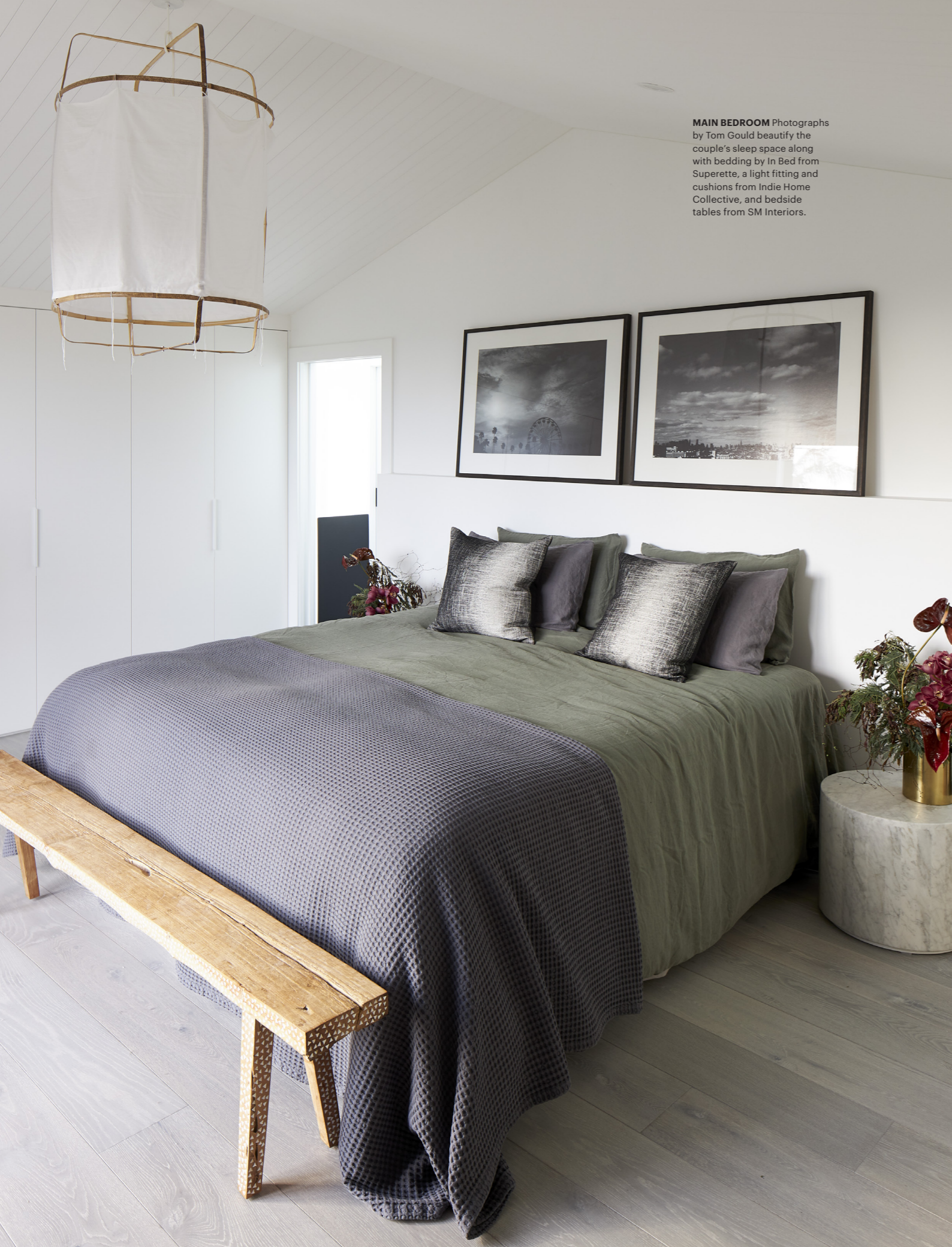
MAIN BEDROOM Photographs by Tom Gould beautify the couple's sleep space along with bedding by In Bed from Superette, a light fitting and cushions from Indie Home Collective, and bedside tables from SM Interiors.