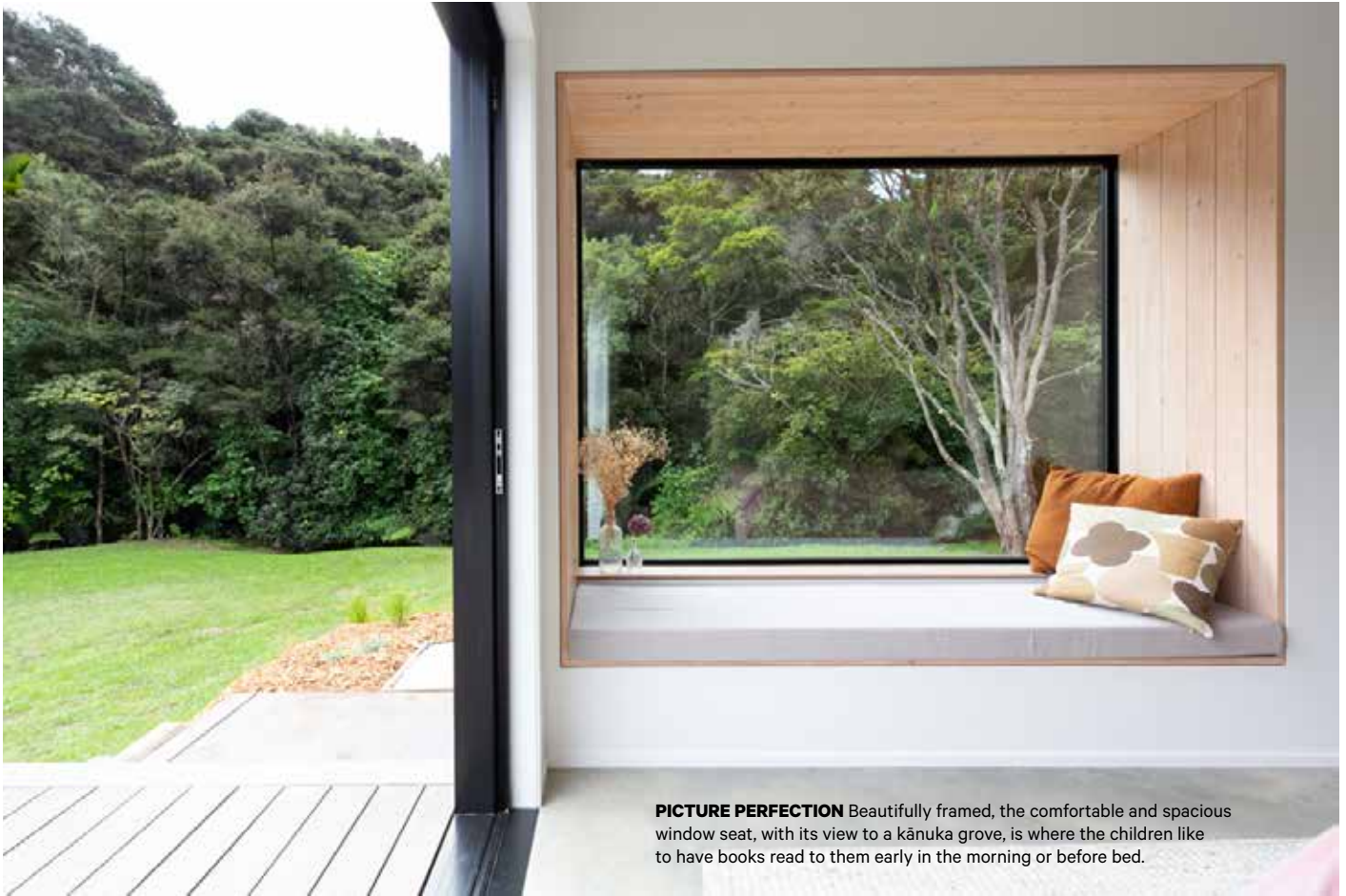
PICTURE PERFECTION Beautifully framed, the comfortable and spacious window seat, with its view to a kānuka grove, is where the children like to have books read to them early in the morning or before bed.

They hired a digger to shape the land themselves, sowing lawn, planting an orchard and hedging around the deck and section for privacy. Their handiwork extended to creating a kids' playhouse, a Gabon basket retaining wall and building a bridge over the local stream, a favourite spot for the family to explore. "There are several eels and kōura (including their 'pet' eel, Courgette) and the kids like doing leaf boat races, or walking over logs that cross the stream."