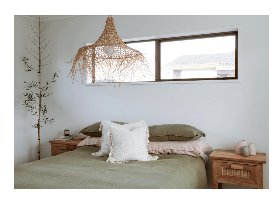
DREAM SCENES Karen and Freya are fans of beautiful linen and sourced their bedding from I Love Linen, which works in harmony with the natural rattan and wood touches used in the sleeping areas. All the lampshades are from Corcovado.

Although there were a few barneys along the way, which is only natural when it comes to working with family, the clever duo have produced results they are both proud of.