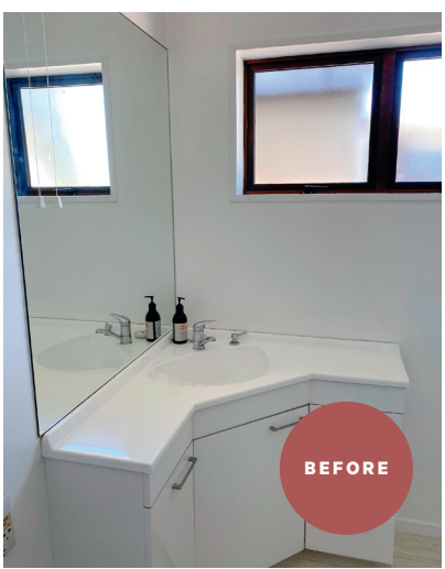
BATHROOM (left) The splashback tiles are from Tilemax, the vanity is bespoke and the brass tapware from Abi Interiors. LAUNDRY (top) This is Freya's favourite room. OUTDOORS (below) Creating a coastal sanctuary was something the Whites wanted to achieve from the start and this private area looks serene and charming.

Freya reflects, "Mum was a stickler for going to the dump to drop off any little bit of trash, which meant we were basically at the dump every couple of days, much to my frustration."