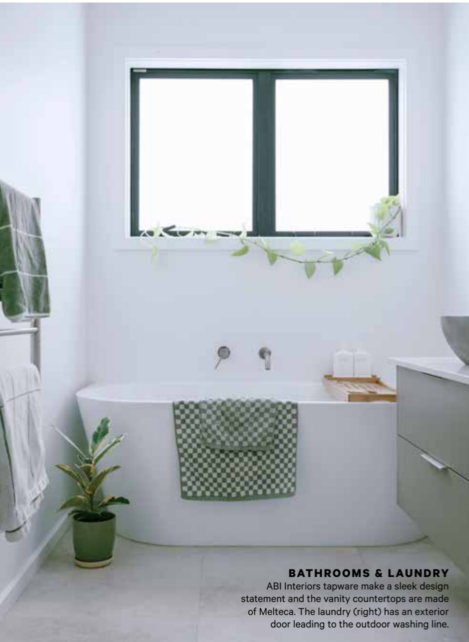
BATHROOMS & LAUNDRY ABI Interiors tapware make a sleek design statement and the vanity countertops are made of Melteca. The laundry (right) has an exterior door leading to the outdoor washing line.