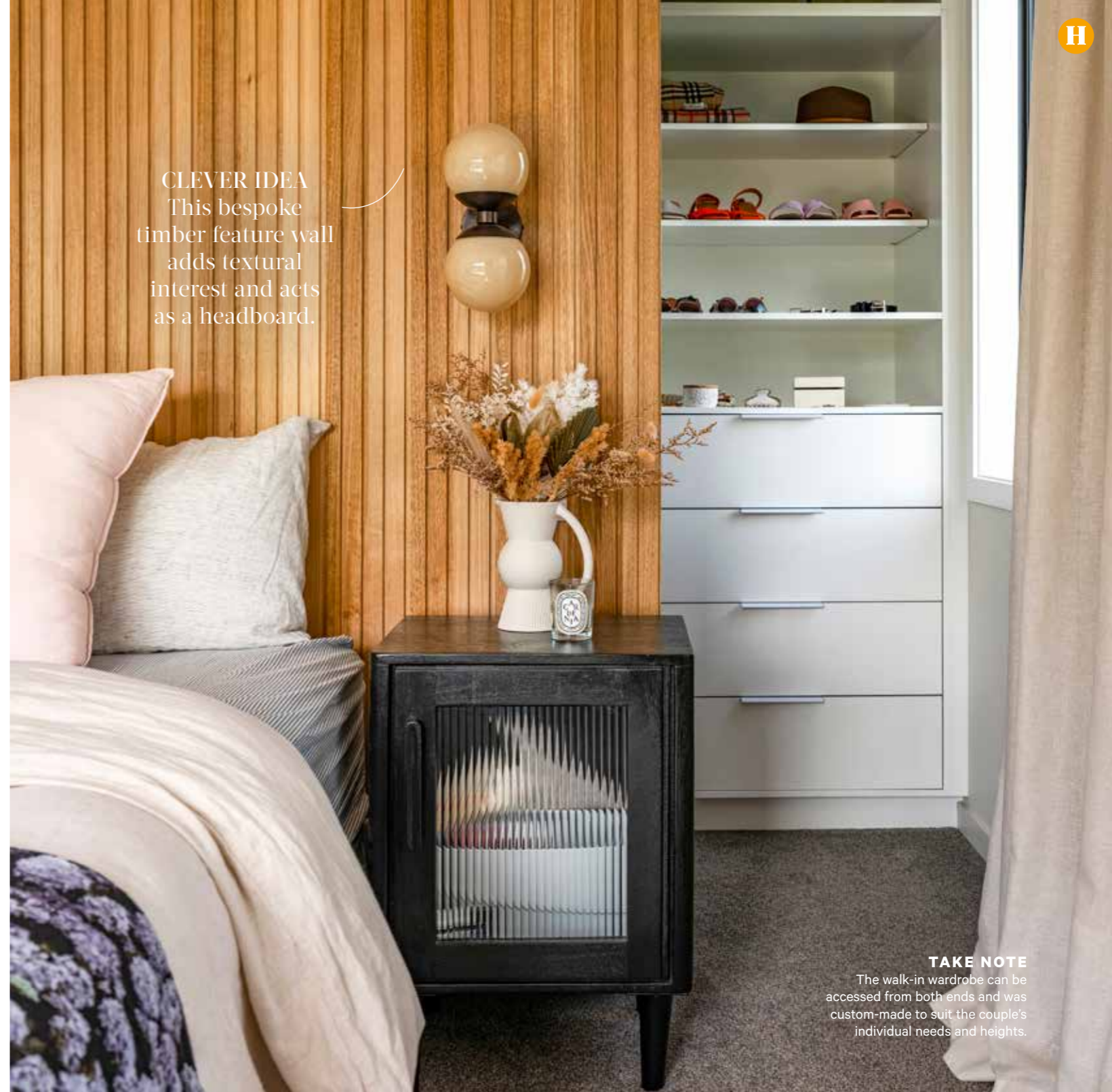
CLEVER IDEA This bespoke timber feature wall adds textural interest and acts as a headboard.

Again, no regrets on the extra space here. “I love the size of the ensuite, the double shower is so convenient for getting ready in the morning, and the space feels so calm,” says Laura.