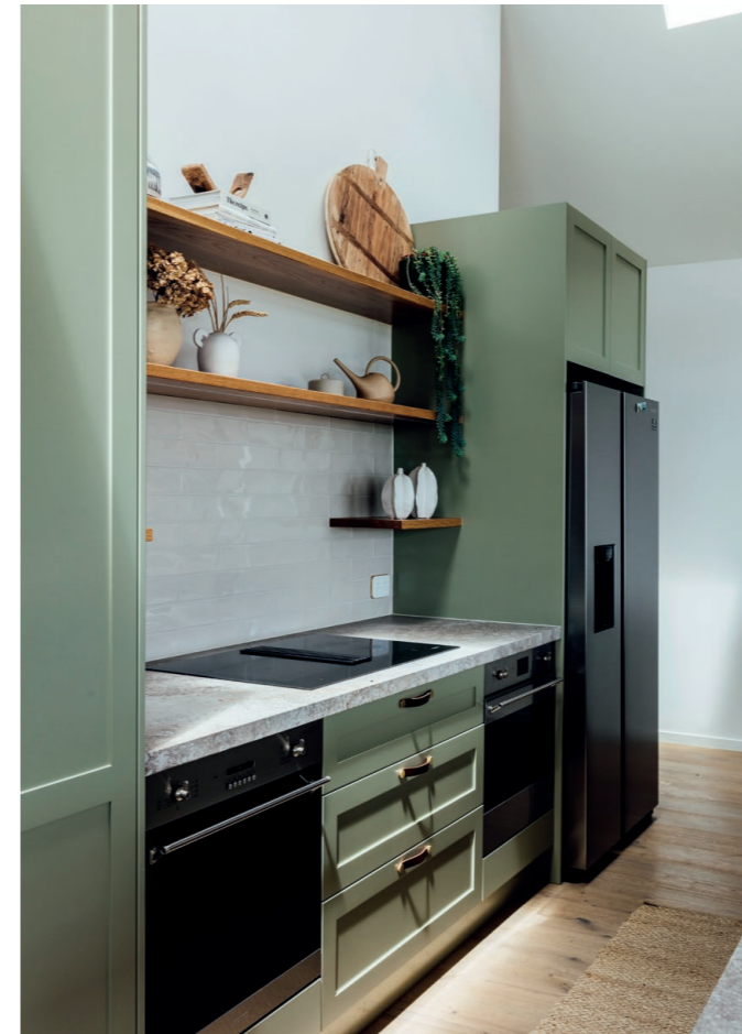
BELOW LEFT The kitchen's colour palette includes Resene Double Lemongrass on the rear cabinetry and Resene Eighth Lemongrass on the island cabinetry, all made by Tauranga's Creative Kitchens & Interiors. New Wave Dove Grey tiles from Tile Warehouse form a hand-crafted splashback that melds well with the benchtop in Excava Caesarstone and is repeated in the ensuite for continuity. BELOW RIGHT Adjacent to the island, above a sideboard inherited from Sam's late grandad, Please Pass the Bliss by Jen Sievers complements the colours in the kitchen.