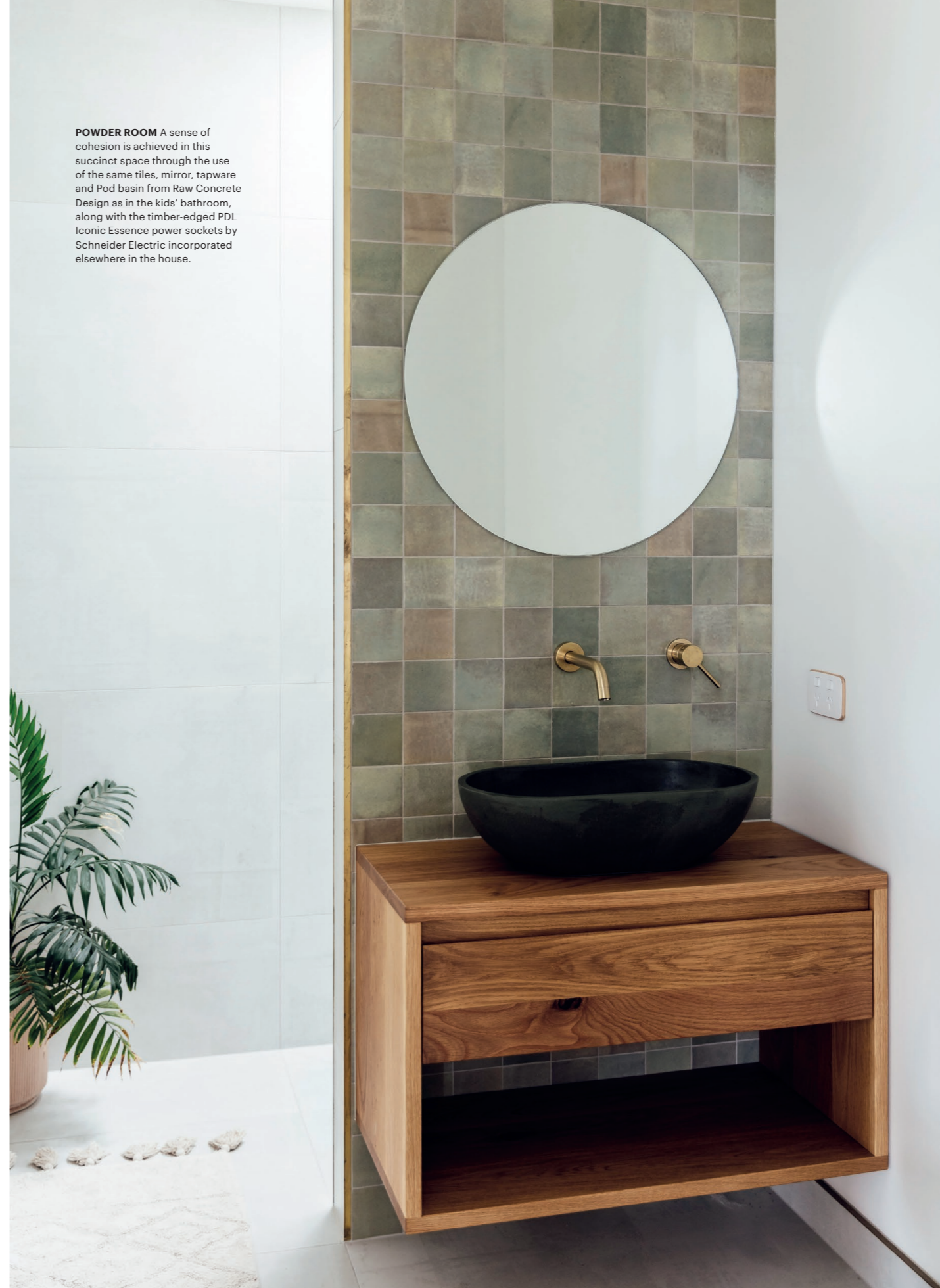
POWDER ROOM A sense of cohesion is achieved in this succinct space through the use of the same tiles, mirror, tapware and Pod basin from Raw Concrete Design as in the kids' bathroom, along with the timber-edged PDL Iconic Essence power sockets by Schneider Electric incorporated elsewhere in the house.