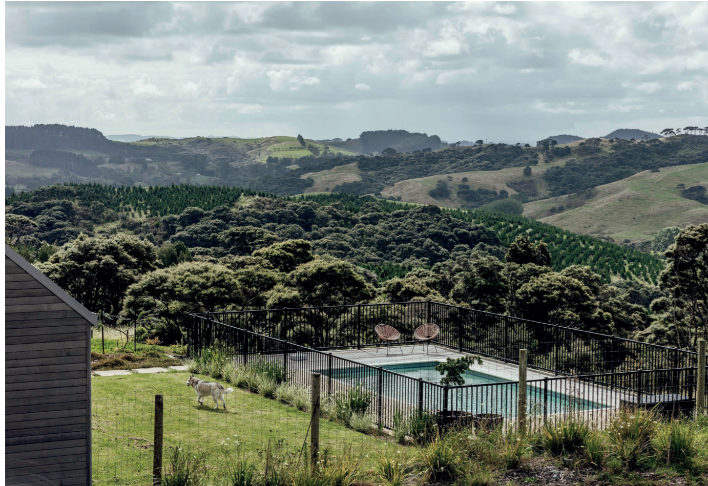
ABOVE Pace Pools constructed the concrete pool that sits on the far side of the property; it's not quite an infinity pool but still enjoys an incredible vista. The couple have planted fruit trees around their water tanks for disguise and their delectable harvest — next, they're considering getting a few alpacas to help them keep the grass under control.