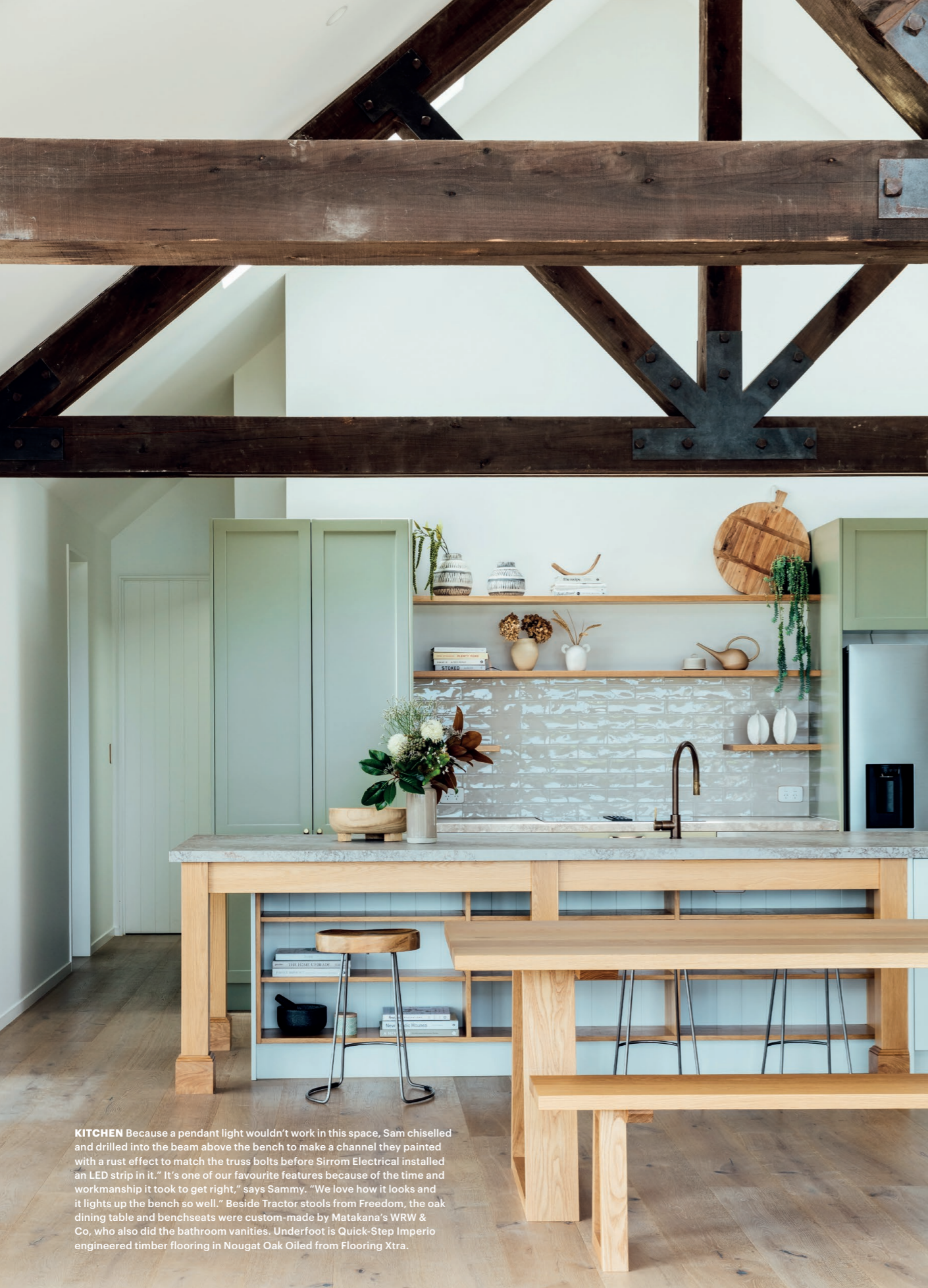
KITCHEN Because a pendant light wouldn't work in this space, Sam chiselled and drilled into the beam above the bench to make a channel they painted with a rust effect to match the truss bolts before Sirrom Electrical installed an LED strip in it. "It's one of our favourite features because of the time and workmanship it took to get right," says Sammy. "We love how it looks and it lights up the bench so well." Beside Tractor stools from Freedom, the oak dining table and benchseats were custom-made by Matakana's WRW & Co, who also did the bathroom vanities. Underfoot is Quick-Step Imperio engineered timber flooring in Nougat Oak Oiled from Flooring Xtra.