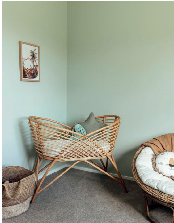
TOP LEFT Dulux Flat Island on the walls in the couple's bedroom makes it an atmospheric haven. On the wall on either side of the bed are Holophane Cone lightshades by Vintage Industries, the side tables and headboard are from Freedom and the bedding is from Città and Farmers. TOP RIGHT A lighter mood is set in the ensuite by New Wave Dove Grey wall tiles and Venice Villa Ivory floor tiles, both from Tile Warehouse. 360 Glass made the mirrors in all three bathrooms. ABOVE LEFT Nala's room is pretty in putty-pink Dulux Parchment Paper. Décor highlights in here include her headboard from Bohème Home and stool from Bunnings. ABOVE RIGHT On Rivah's walls is Dulux Half Ngataringa Bay. Her bassinet from Bohème Home is a great match for the chair from The Importer.