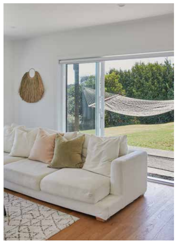
WHITE EVERY TIME On moving in, one of the first things the family did was repaint the walls with Resene Alabaster. In complete contrast, the house exterior was painted in a dark Dulux shade. The oak floor boards are from Allied Flooring, the sofas from Contempa, dining table from Citta, and the dining chairs from Ico Traders.