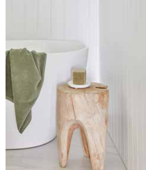
BY EXTENSION The family bathroom was made significantly larger by removing the existing linen cupboard, hallway, separate toilet and bathroom. Vertical join panelling was used on the walls and the marble tiles used on the floor are from The Tile Room.

With Alex and Mel's love of minimalism and white, they have created a calming coastal home that's free of chaos and clutter. The natural timber tones, marble and textures enhances the resort-like vibe.