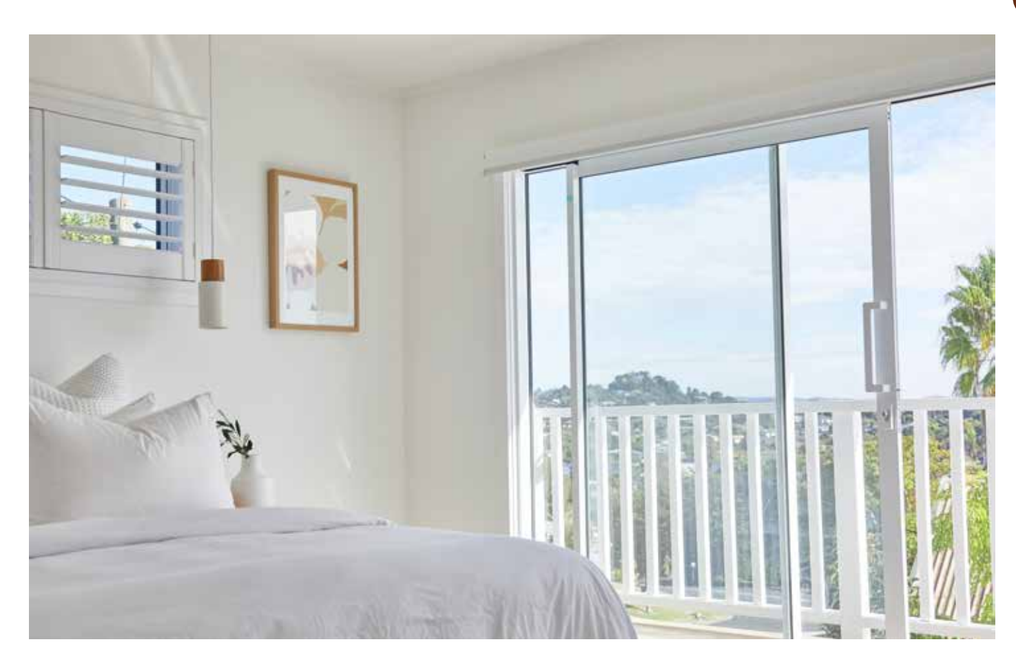
"Design your home around what you love and how you want to live in it."

Mel reflects, "Our home is everything we could have hoped for and there's very little we would change. Apart from hopefully putting in a pool sometime, we won't be moving for quite some time." It just goes to show that things can change, and you shouldn't always make up your mind after an awkward first date. •