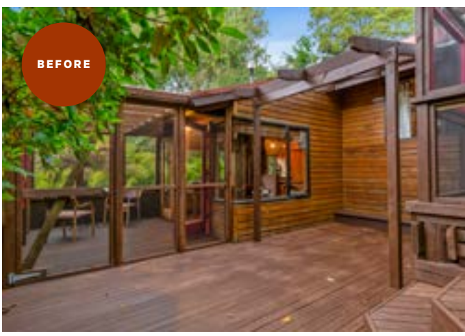
BATHROOM The rimu wainscoting, bathtub and its surrounds, and cabinets were removed. It was made over with floor to ceiling tiling, insulated flooring and a new cantilevered vanity unit. A chunky stone basin, sleek tapware and a freestanding bath helped modernise the space. DECK The dark and gloomy exterior with its 'log cabin' siding and chunky wooden pergola were given a few coats of white paint more sympathetic to the green surroundings.