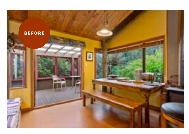
THE CEILING The stained Douglas fir ceiling was too dark and difficult to restore to a lighter shade. It was a tough decision, but they decided to paint it.